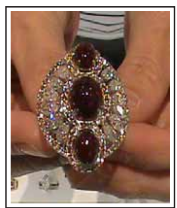
RJ Jewelers Estate Jewelery. Very Unique Cabachon Ruby Ring. Diamonds 3.83tw. 18kt white gold setting. Price: $7,995

Rubies were worn by kings and aristocrats since the dawn of time. Ruby comes from the Latin word ruber which means red. It was said to ward off sickness and to make one invulnerable to defeat. During ancient times it was said that