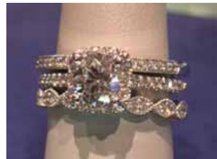
Levy Stackable Anniversary Band and Twisted Eternity Band with Round Brilliant Engagement Ring

Based in Chicago, Levy Creations is one of the largest manufacturers of distinctive engagement and wedding sets in the country. From design to manufacturing, Levy Creations one of the few companies to create nearly all products from start to finish in one facility. Their designers are constantly working to create new and unique styles of unsurpassed beauty and desirability. High quality and workmanship is prevalent in all of Levy Creations' diamond rings, pendants and earrings. RJ Jewelers offers a wonderful collection of Levy Creations. If you are thinking of proposing this Holiday Season, then you must stop in and talk to our staff about purchasing a diamond engagement ring. Our staff will take the time to educate you all about diamonds and their quality and values. If your anniversary is in the near future you may want to add a diamond anniversary band to her wedding rings. Stacking anniversary bands and birthstone bands are very popular today. RJ Jewelers offers easy financing options. We have interest rates as low as 9.99% with low monthly payments. We also have offer a 12 months interest free option. See store for details.