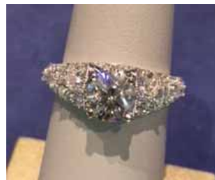
Levy Creation Round Brilliant Engagement Ring with 1.04ct center diamond with .85tw side diamonds.